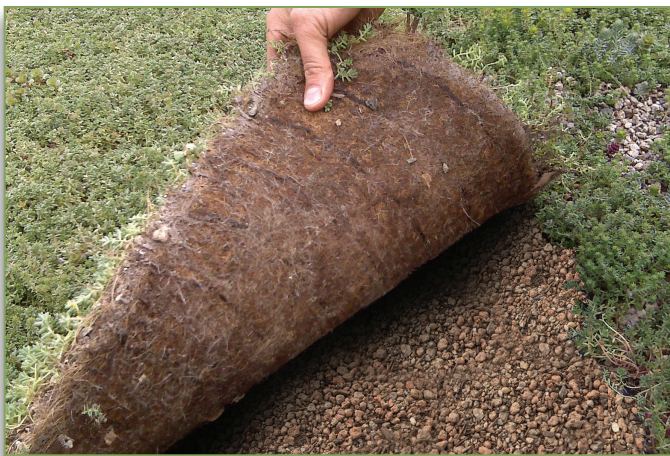
At time of delivery

Varieties - Wide variety of sedums suiting different climates and exposures.