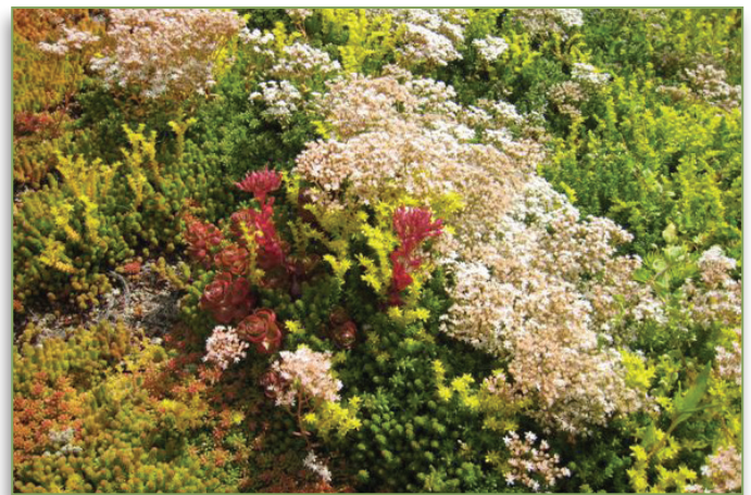
Within 2-3 months