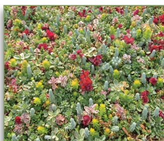
Full Color Maximum color impact