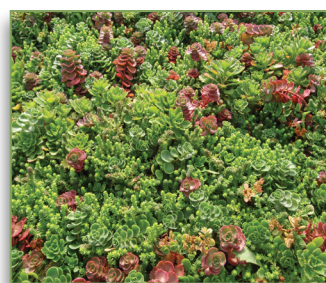
Shade Tolerant Withstands light shade