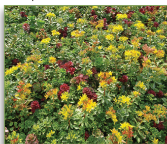
Four Season Year round interest

Customization - Custom tiles are available, contact Hydrotech for specifics. For a unique look, perennial plants can be incorporated into InstaGreen Sedum Tile.