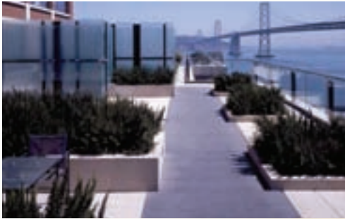
Gap Headquarters - San Francisco, CA