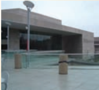
Constitution Center - Philadelphia, PA

Much has changed in our industry since I began my career over 40 years ago, but the values that underpin our success have not: integrity, quality, trust, accountability and relationships based on respect for each other. At American Hydrotech we have talented and energetic people who have a passion for their work and who are committed to providing value at a fair price.