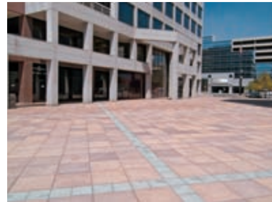
Heber Wells Building - Salt Lake City, UT