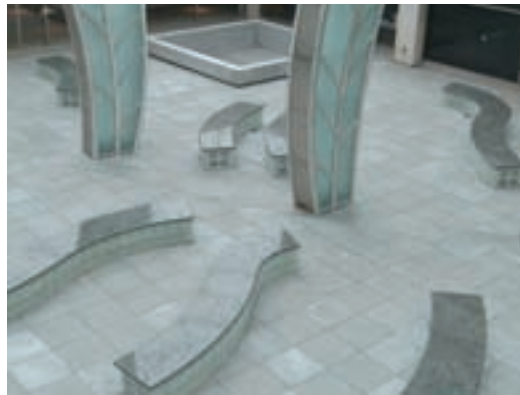
SEPTA Station – Philadelphia, PA