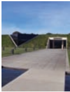
Artesa Winery - Napa, CA