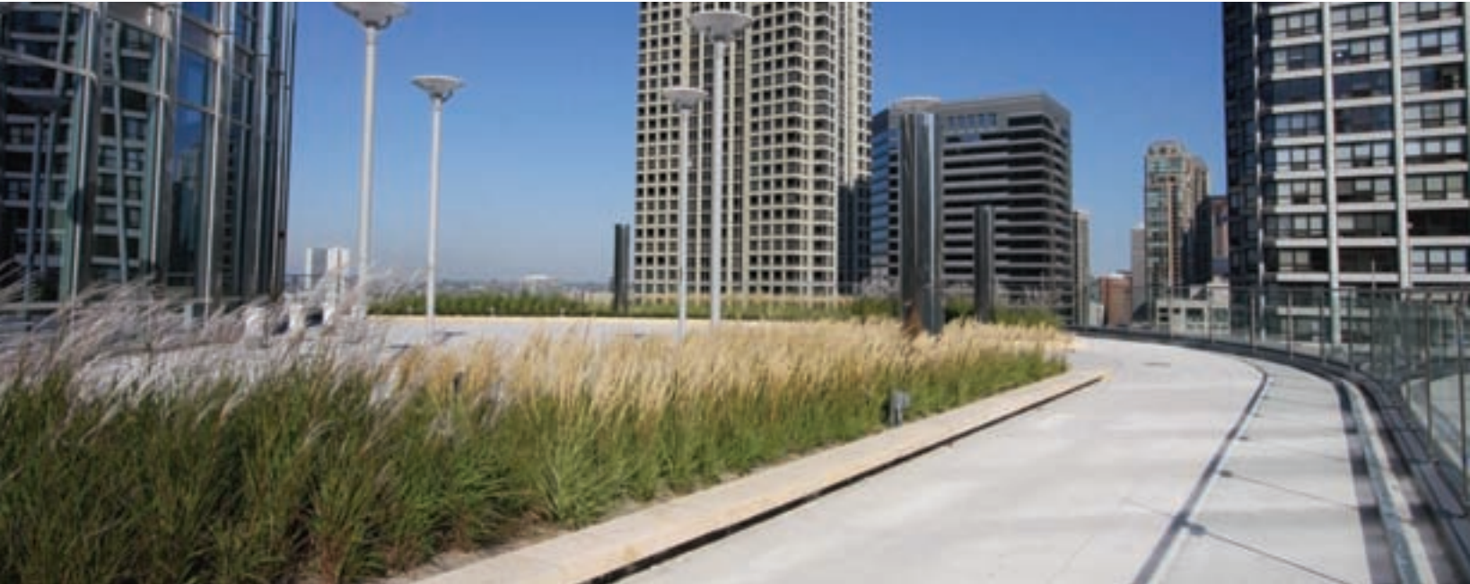
Trump International Hotel & Tower – Chicago, IL

Please contact Hydrotech for specific warranty terms and conditions.