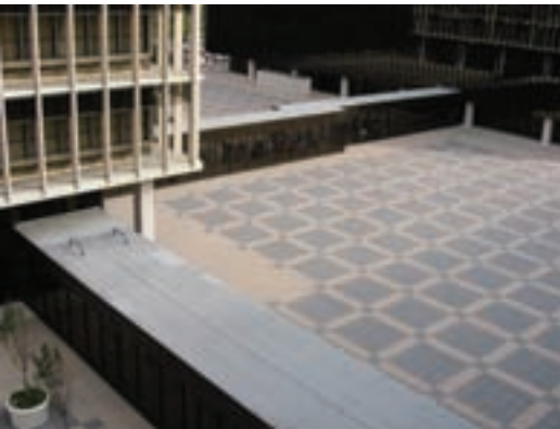
American General - Houston, TX

Installation Flexibility - pavers are set directly on spacer tabs or adjustable pedestals to an established grade and even leveled where a sloped deck exists – a simple, durable solution.