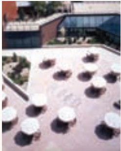
Cavalry Hospital - Bronx, NY